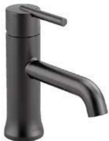
Delta Faucet Modern 14 Series Matte Black Shower Faucet