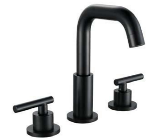
Nicoli 8 in. Widespread 2-Handle Bathroom Faucet in Matte Black