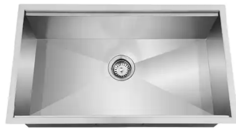
Zero Radius Undermount 18G Stainless Steel 32 in. Single Bowl Workstation Kitchen Sink