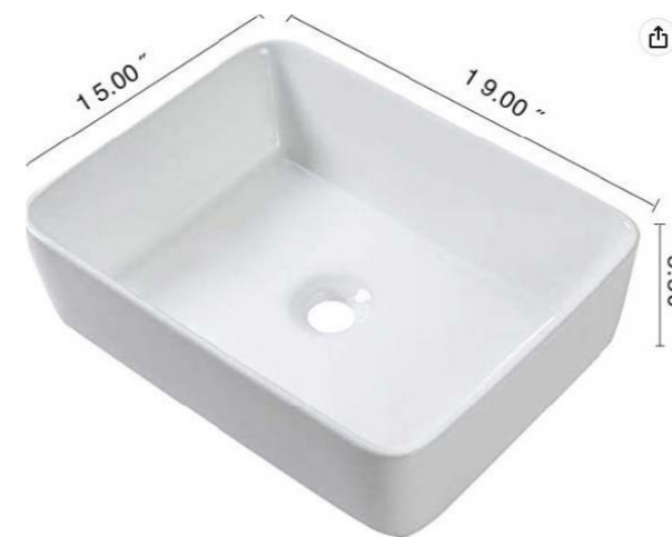
Rectangular Bathroom Ceramic Vessel Sink Art Basin in White