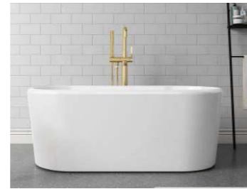
Caserta 67 in. x 27.6 in. Acrylic Flatbottom Soaking Bathtub in White