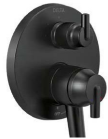
Trinsic 2-Handle Wall-Mount in Matte Black