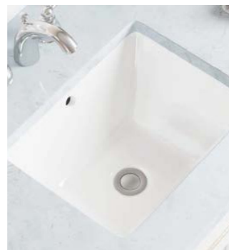
Undermount Porcelain Bathroom Sink in White