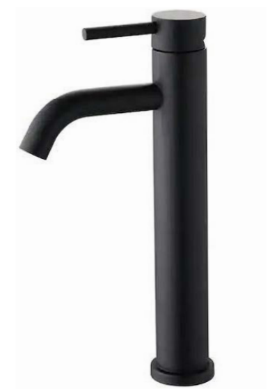
Single Hole Single Handle Vessel Sink Faucet in Matte Black