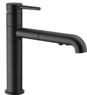
Delta Faucet Trinsic Single-Handle Kitchen Sink Faucet in Matte Black