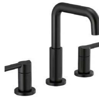
Nicoli 8 in. Widespread 2-Handle Bathroom Faucet in Matte Black