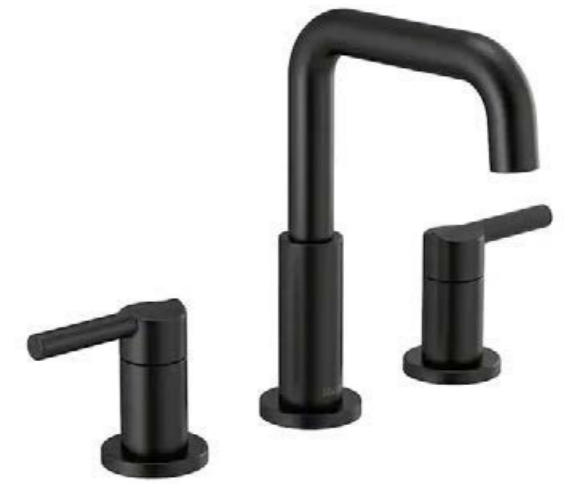
Nicoli 8 in. Widespread 2-Handle Bathroom Faucet in Matte Black