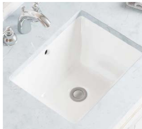
Double Handle Three Hole Widespread Brass Rotatable Bathroom Faucet in