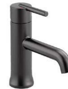
Nicoli 8 in. Widespread 2-Handle Bathroom Faucet in Matte Black