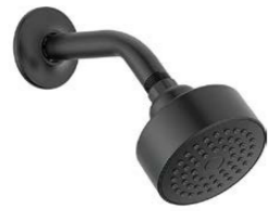
Delta Faucet Modern 14 Series Matte Black Shower Faucet