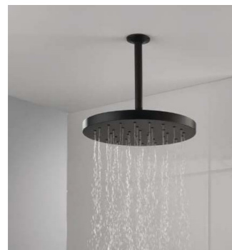
H2Okinetic in Matte Black