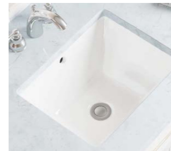
Undermount Porcelain Bathroom Sink in White