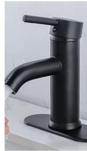
Delta Faucet Modern 14 Series Matte Black Shower