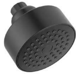
Wall Mount Fixed Shower Head in Matte Black