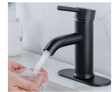
Nicoli 8 in. Widespread 2-Handle Bathroom Faucet in Matte Black